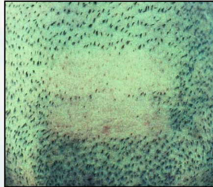
chin test patch 1 treatment, 2 months after treatment

and is absorbed maximally by the melanin in the hair follicle and minimally by any other tissue. Using special filters, or