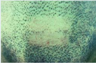
LASER HAIR REMOVAL