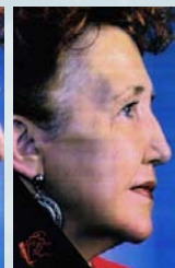
LASER WRINKLE REMOVAL - before